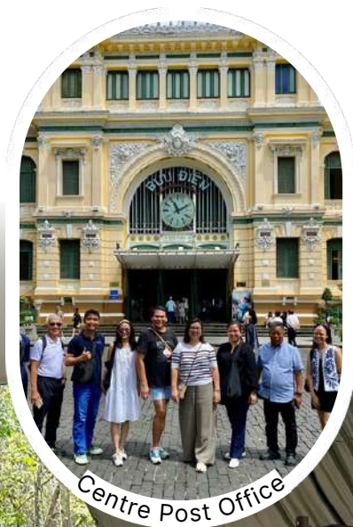
Centre Post Office