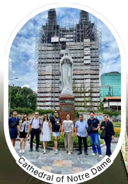
Cathedral of Notre Dame