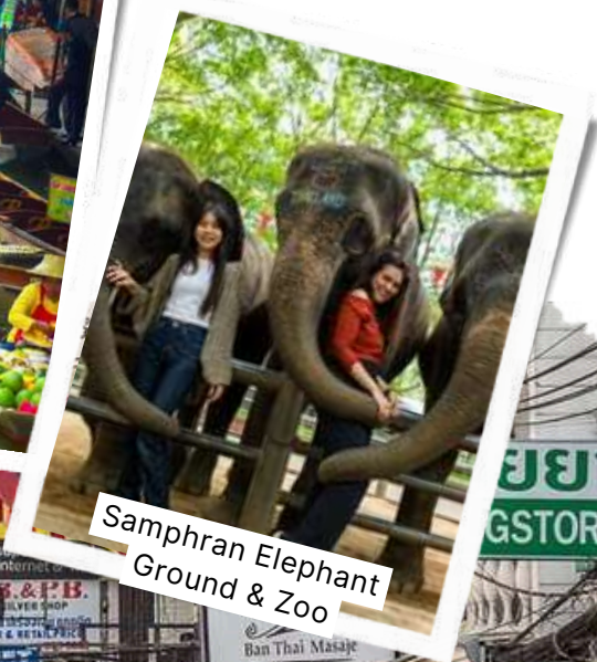
Samphran Elephant Ground & Zoo