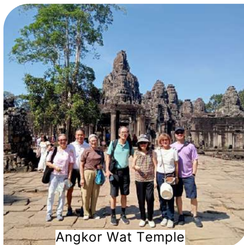
Angkor Wat Temple