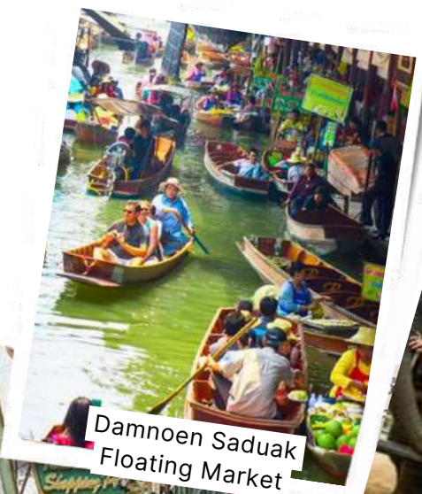
Damnoen Saduak Floating Market