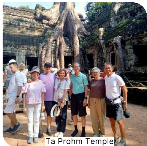
Ta Prohm Temple